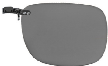
ref 11/800604 Colour: Grey Polarized Size: 52mm x 42mm Bridge: 16mm

Minimal Clip-on. Petit and light weight clip-on for smaller and/or rimless frames. Cutable acrylic lens. Does not flip up. Polarized lens for glare reduction. Comes with storage case & microfibre lens cloth.