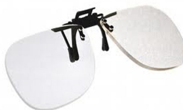
03/C4217 Flip-up with clear plano polycarbonate lenses. Cannot be cut.

11/084, 11/085, 11/086 and 11/061: Polarized and can be cut to fit. Eyesize: 65mm x 55mm depth Bridge: 16mm