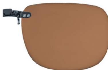
11/800606 Colour: Brown Polarized Size 56mm x 46mm Bridge: 16mm